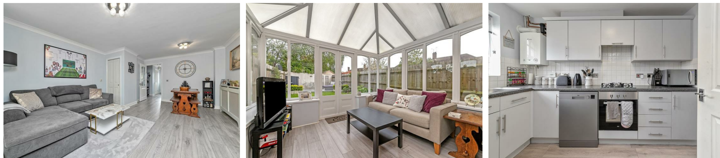
Ground Floor Approx. 475.9 sq. feet

Conveniently located for good local amenities and within walking distance of excellent schools is this three bedroom mid-terrace property. An attractive looking home which is tucked away in a lovely private cul de sac. Spacious living accommodation comprises a fitted kitchen, a well proportioned living/dining room, conservatory and a useful downstairs cloakroom. On the first floor, three bedrooms and a stylish family bathroom. Further benefits include gas central heating and double glazing. To the outside is a low maintenance rear garden, privately enclosed by timber boundary fencing, mostly laid to lawn with patio and a decked seating area. To the front is allocated parking for two cars. Liberty Walk is a private road situated just off Camp Road, close to 'Morrisons' supermarket. St. Albans city centre with its extensive shopping and leisure facilities plus the mainline railway station remains a short distance away.